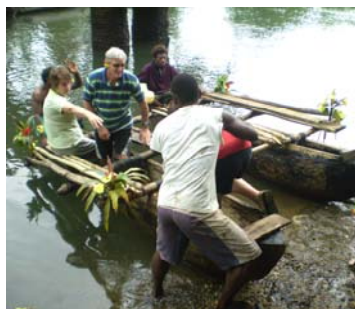
A dugout was part of leisure time activities.

A Wycliffe Associates team helped national staff with valuable building skills when the main office was extended and a carport constructed during June 2008.