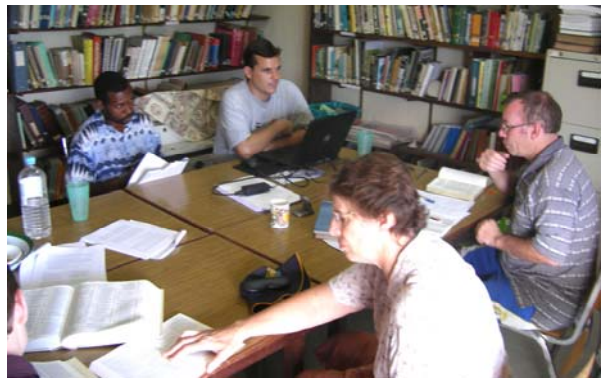
Translation checking - Vanuatu