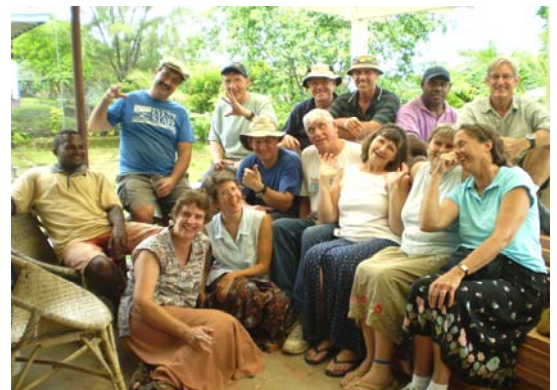
The happy team

The work is now being completed by national staff, who gained many skills by being able to work in a mixed team. They are now finishing the internal lining and flooring. However there is still a lot of work to do.